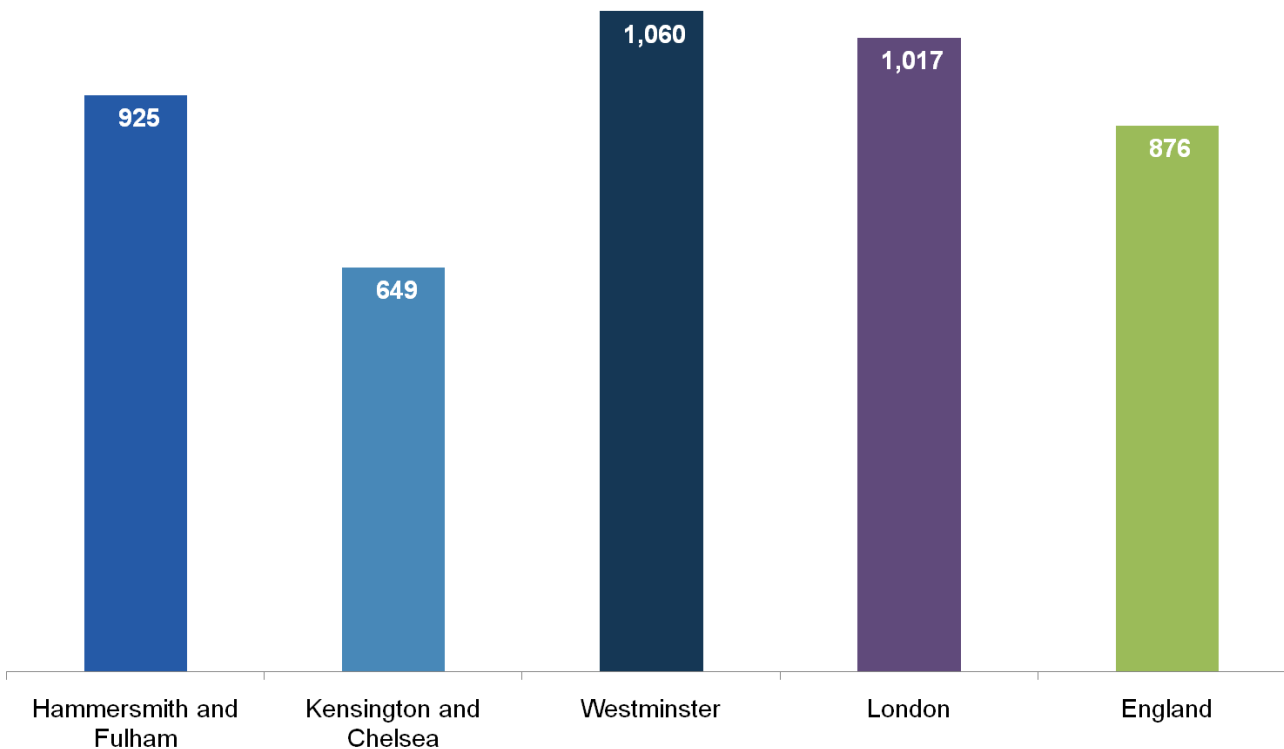
Rate of 10-17 year olds per 100,000 receiving their first reprimand, warning or conviction, 2010/11